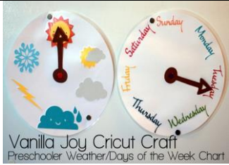
Vanilla Joy Cricut Craft Preschooler Weather/Days of the Week Chart

Image above: this is an example of a weather chart.